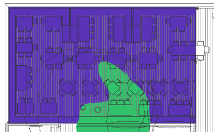
Option of hiring all 3 Bungalows plus the Deck area for larger Functions.